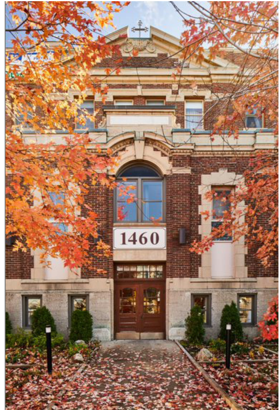
HABITAT 1460 (HABITATIONS LA TRAVERSÉE)