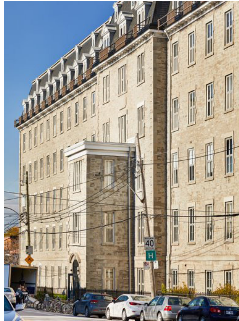
1431, rue Fullum, Montréal (QC) H2E 1A2