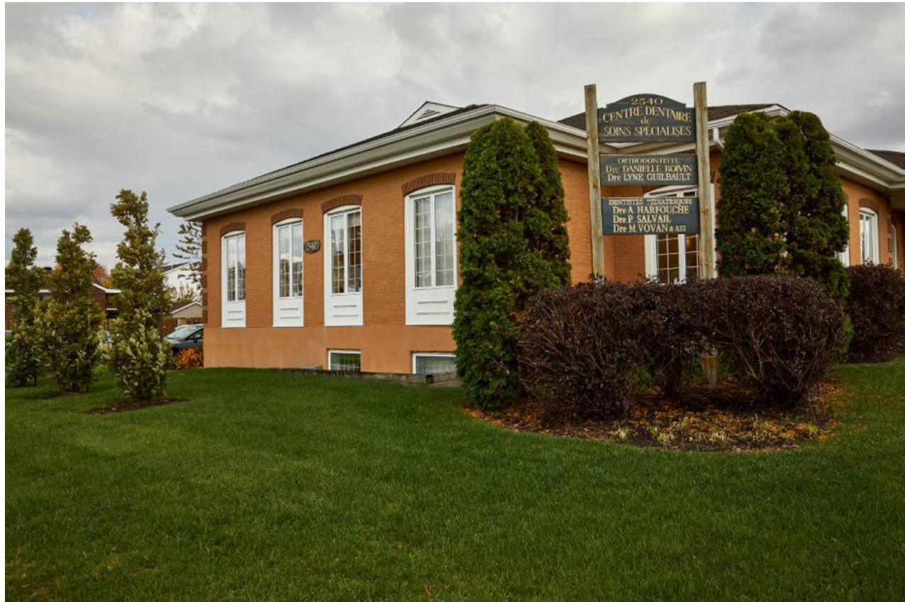
240, Boulevard Lapinière, Brossard (QC) J4Z 3S2